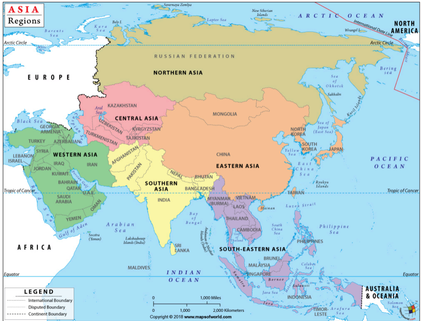
Map 1.: Subregions of Asia